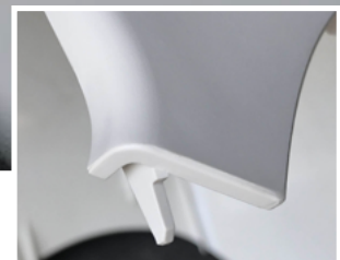
AFTER CLEANING: Part after mold cleaning with Lusin® MC1718/1719

60-70% REDUCTION OF REFURBISH- MENT CYCLES/ YEAR