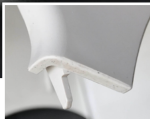
BEFORE CLEANING: Part contamination by mold residues