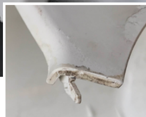
DURING CLEANING: Heavily contaminated part pulled from mold after application of Lusin® MC1718/1719