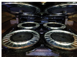
Using Chem-Trend® PH-3073W