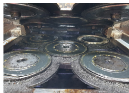
Using a competitive release agent

Through a hands-on process with collaborative testing, we were able to solve all of our aggressive goals with a manufacturer of automotive clutches. Below, you'll see images that display wear following their previous process versus our new process after the exact same number of cycles.